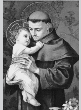
St. Anthony of Padua

Masses: Saturday 5:00 p.m. Sunday 8:30 a.m.